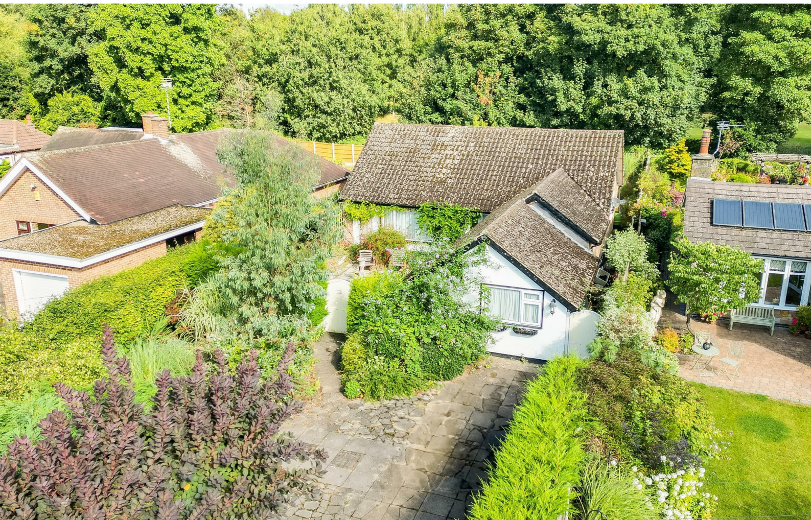
Fairway Drive, Beeston, Nottinghamshire NG9 4BN