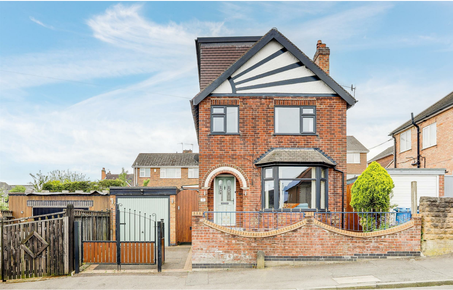
Norman Crescent, Ilkeston, Derbyshire DE7 8NN