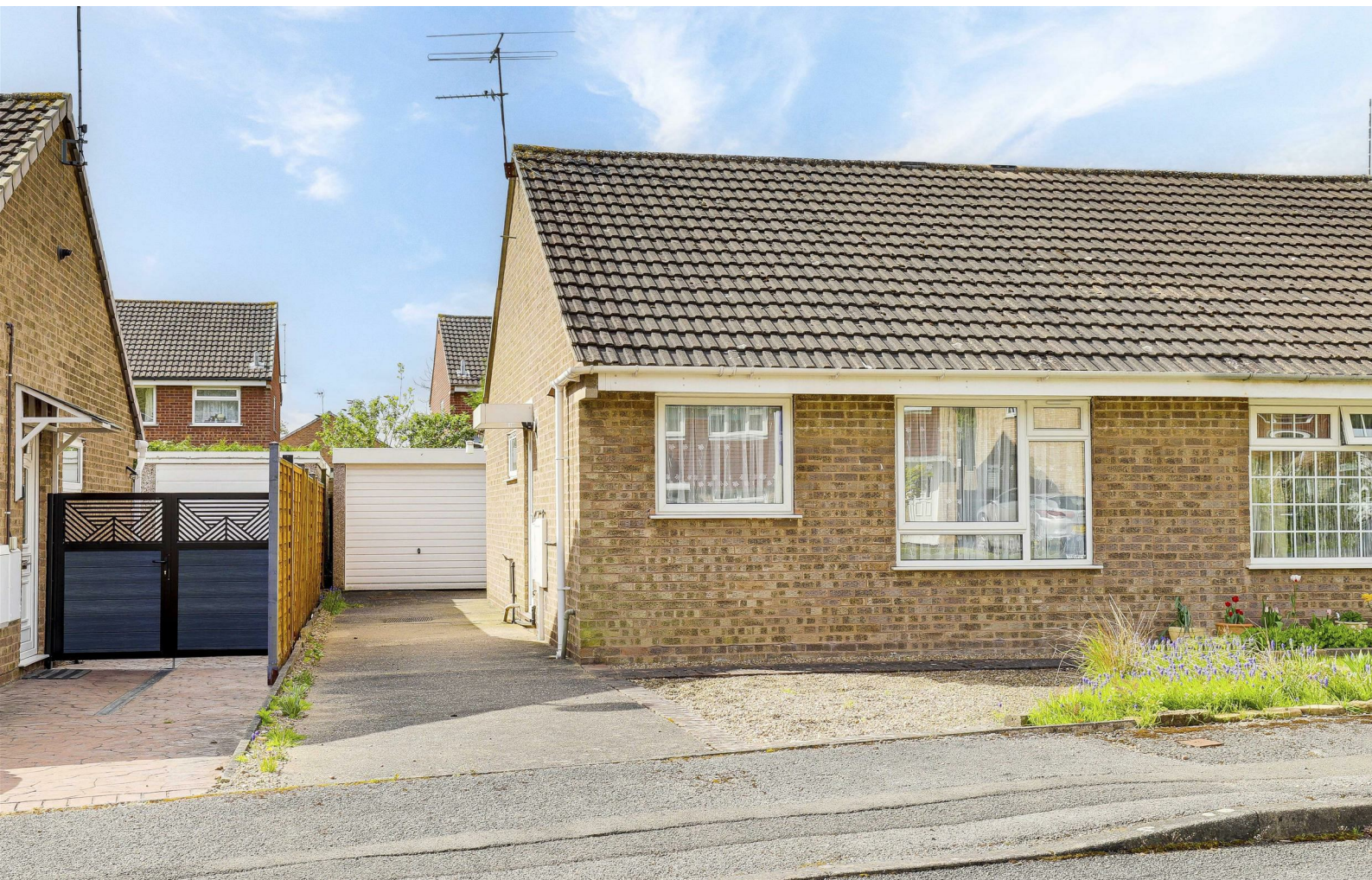
Westray Close, Bramcote, Nottinghamshire NG9 3GP