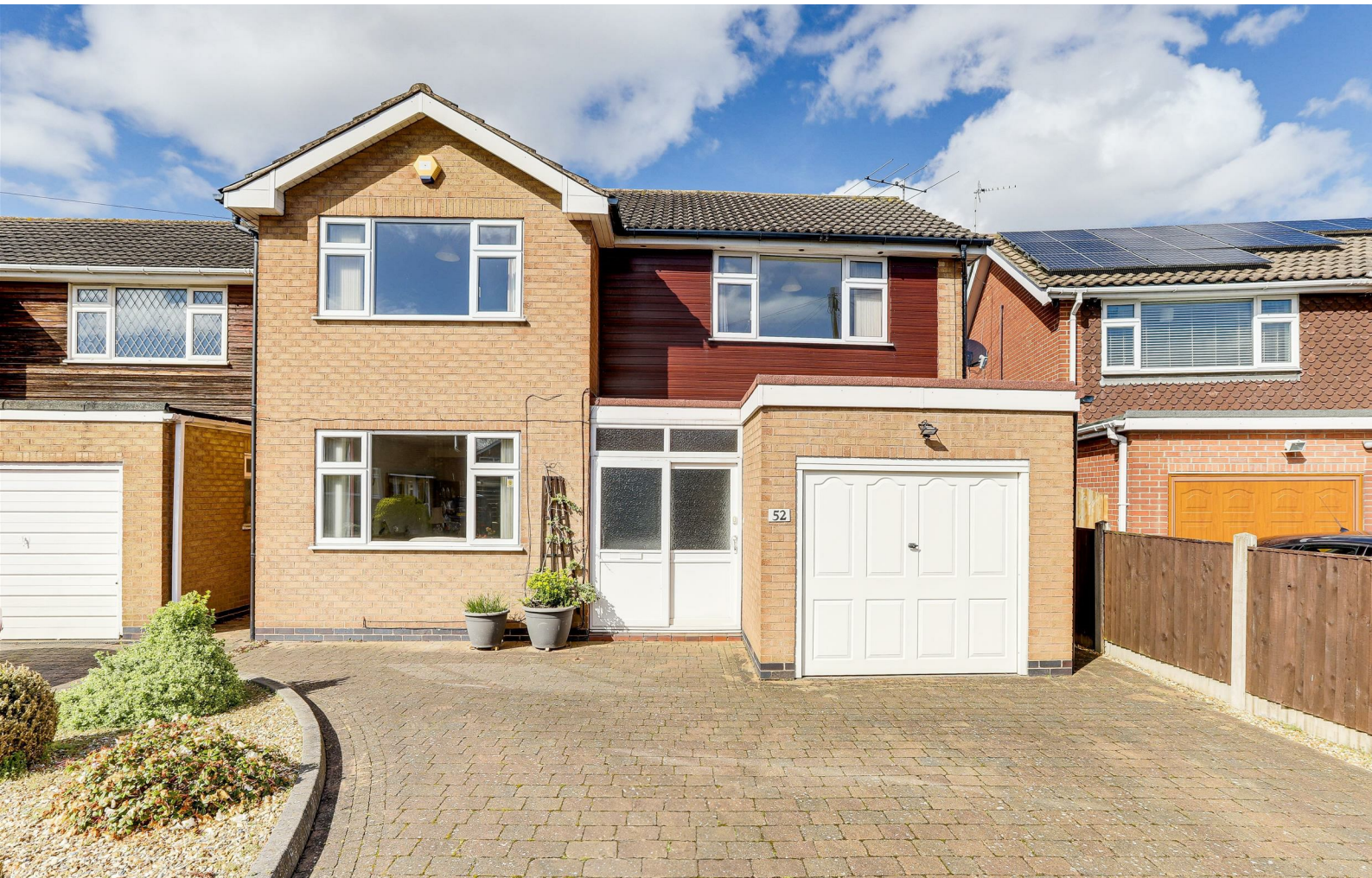
Shirley Street, Long Eaton, Derbyshire NG10 3BN