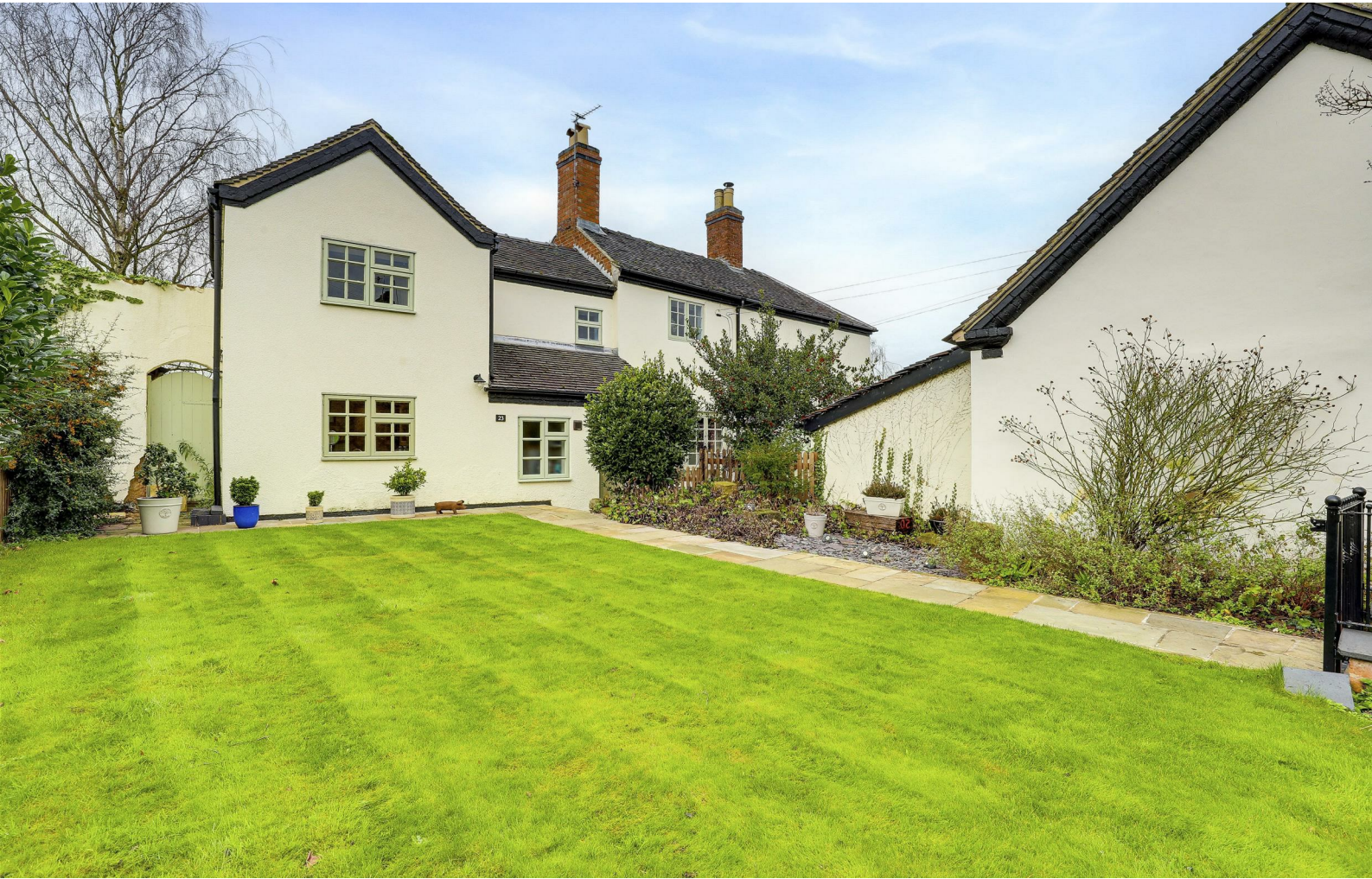
The Green, Aston-On-Trent, Derbyshire DE72 2AA