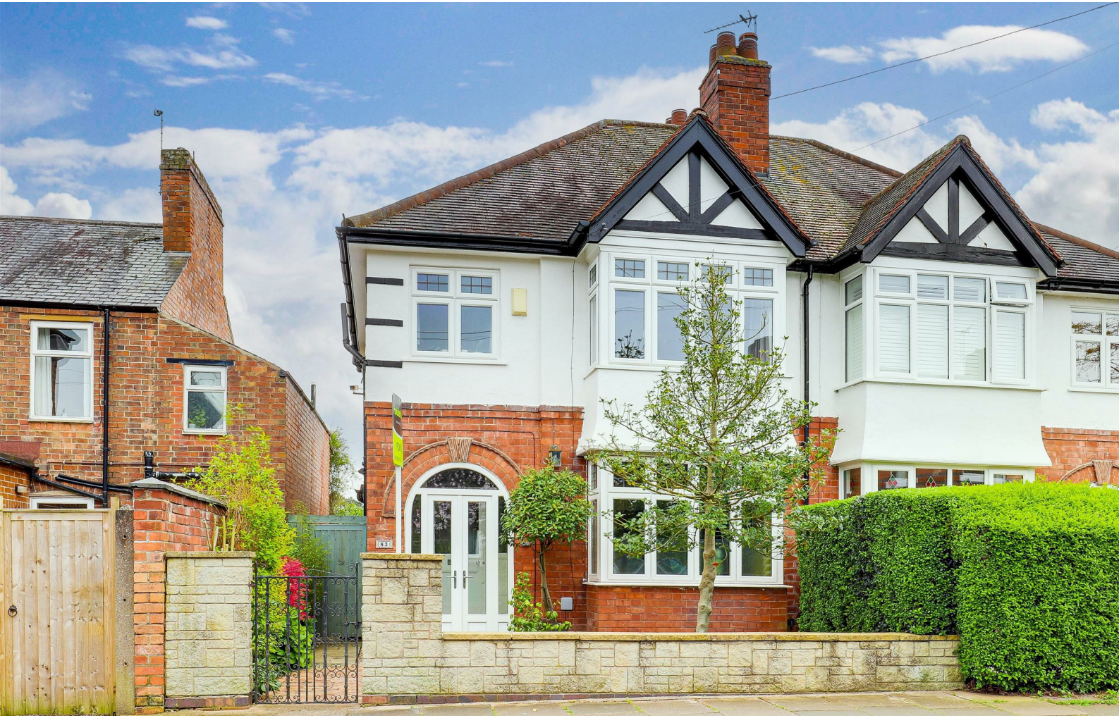
Denison Street, Beeston, Nottinghamshire NG9 1DQ