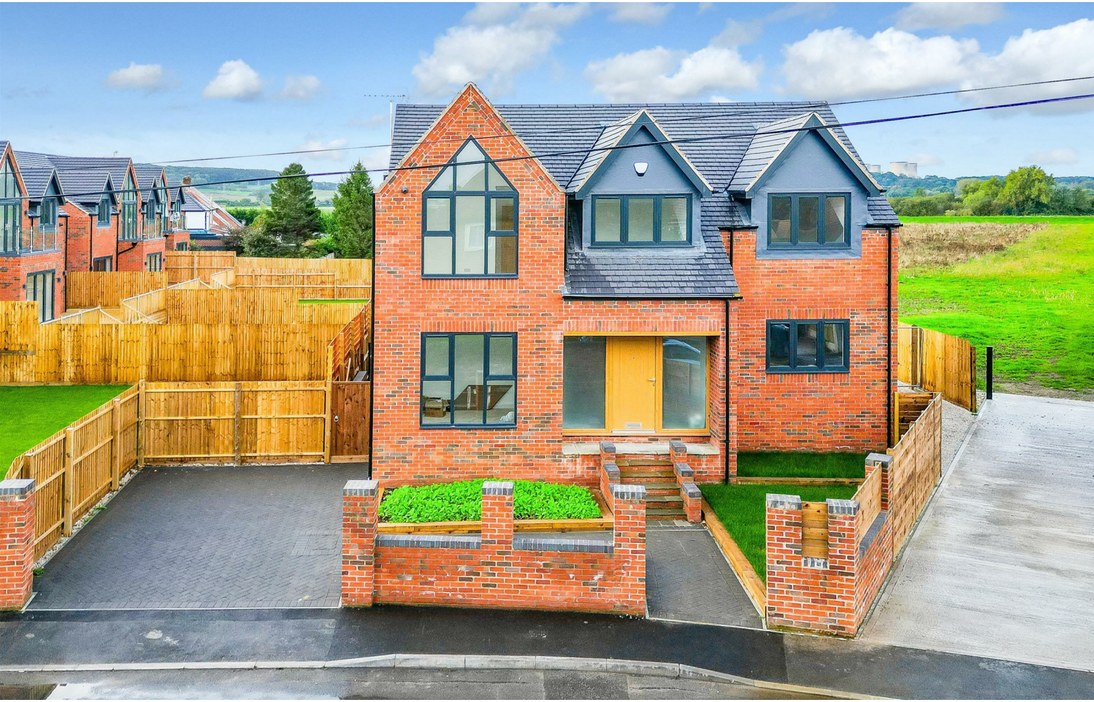
Manor Road, Barton-In-Fabis, Nottinghamshire NG11 0AA