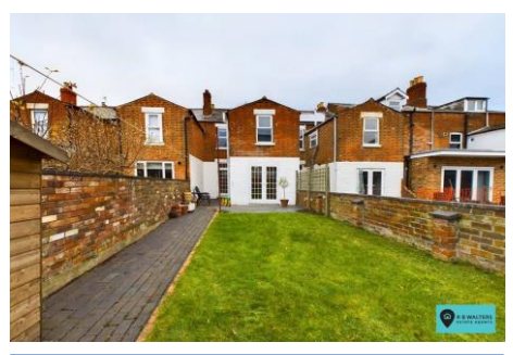
Edwy Parade, Gloucester, GL1 2QH.

Use This Section to Record Your Own Personal Property Notes -