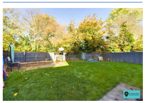
Enborne Close, Tuffley, Gloucester, GL4 0RE.