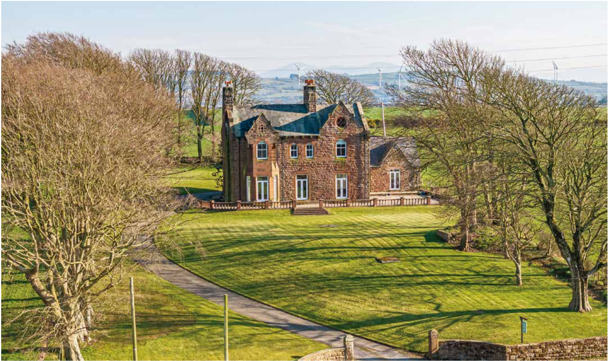
The Old Rectory Hayton | Wigton | CA7 2NN