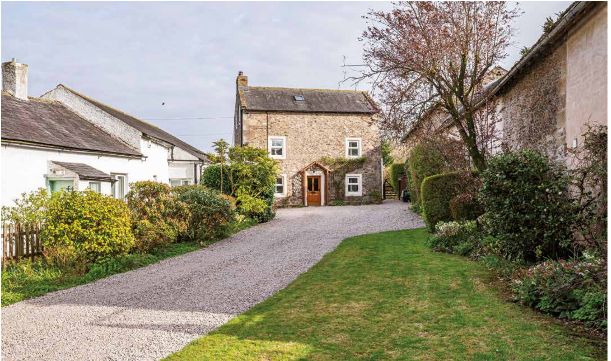
West Garth Burgh-by-Sands | Carlisle | Cumbria | CA5 6BT