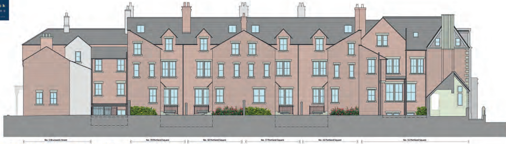
ELEVATION D - Rear Elevation of No.15-19 Portland Square & 15 Brunswick Street