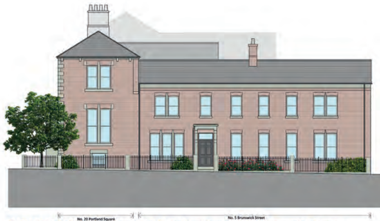
ELEVATION C - Side Elevation of No.20 Portland Square & No.5 Brunswick Street