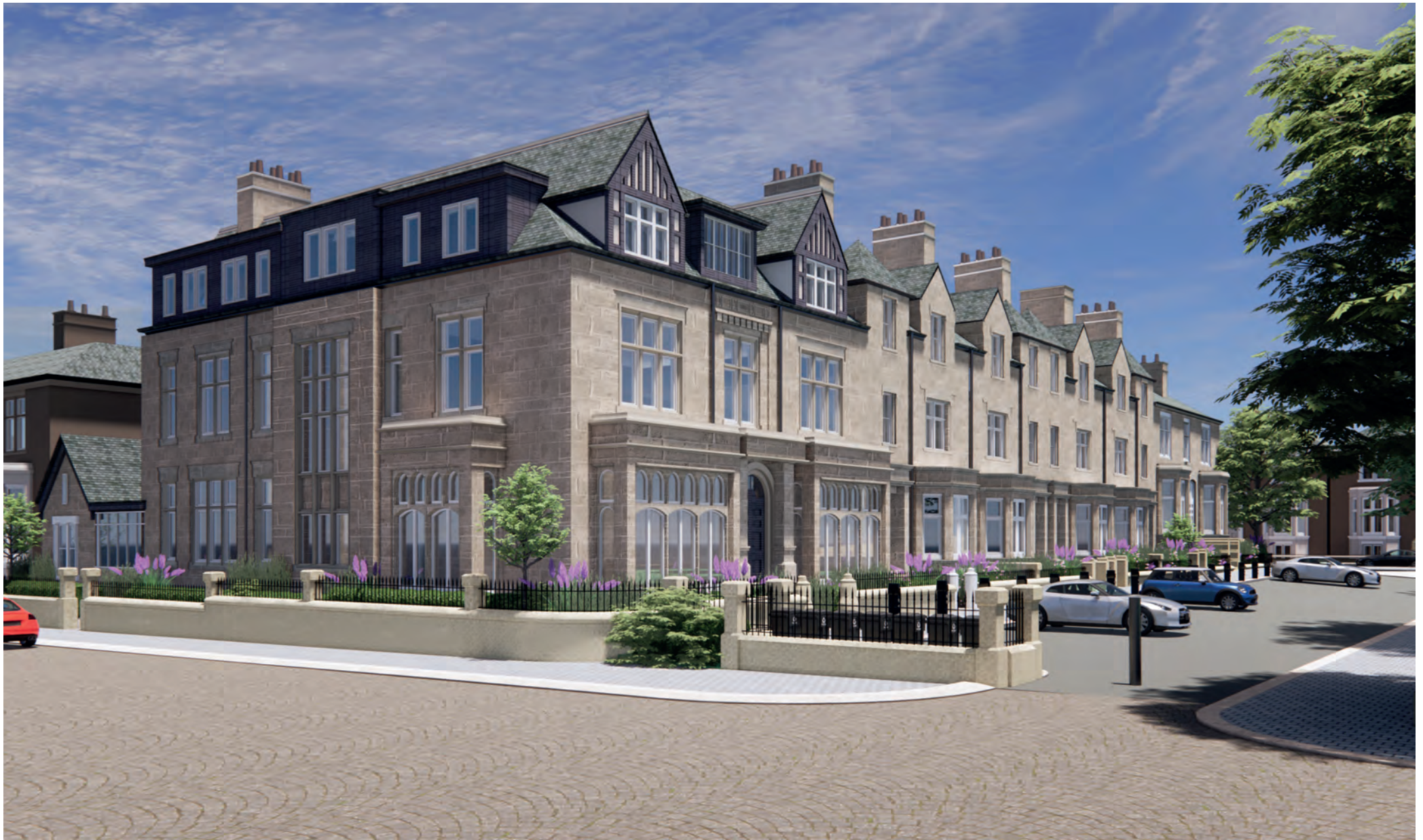
Portland Square South Carlisle | CA1 1AJ