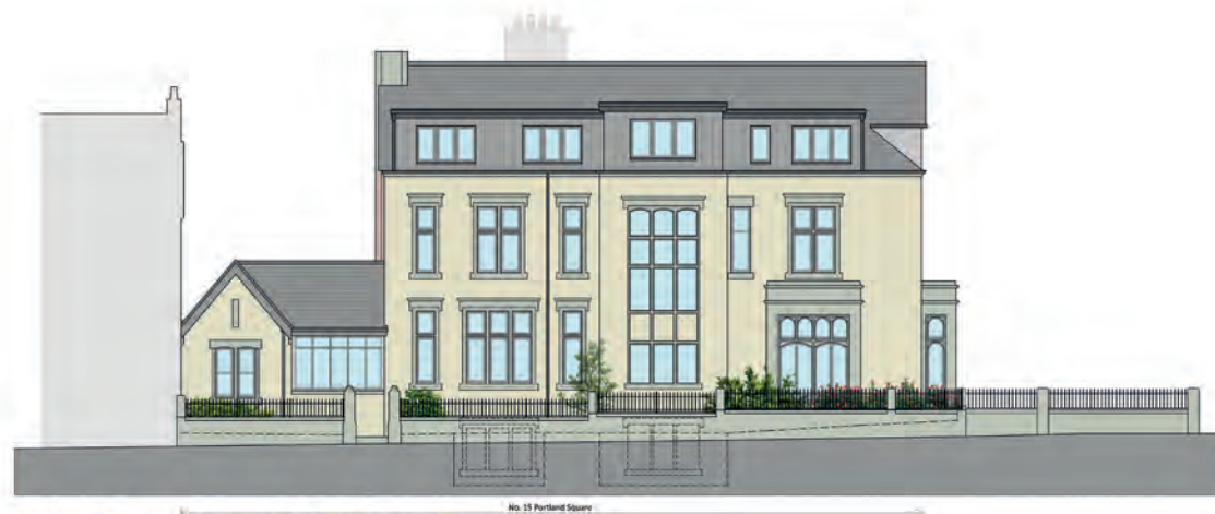
ELEVATION B - Side Elevation of No.15 Portland Square