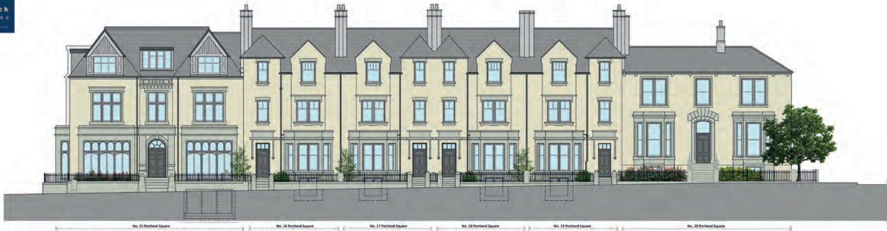
ELEVATION A - Front Elevation of No.15-19 Portland Square & 15 Brunswick Street