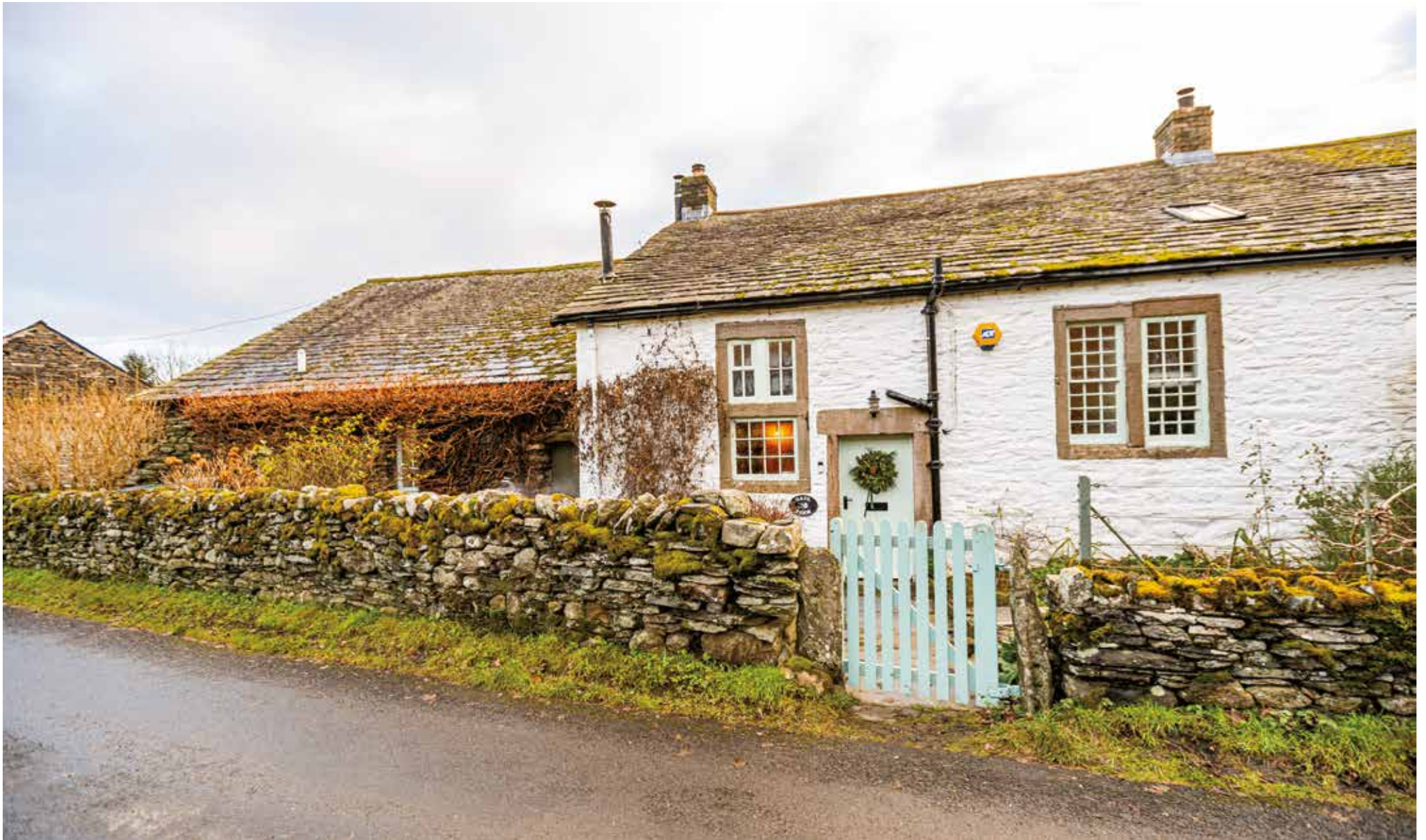
Gate Farm Mungrisdale | Penrith | Cumbria | CA11 0XR