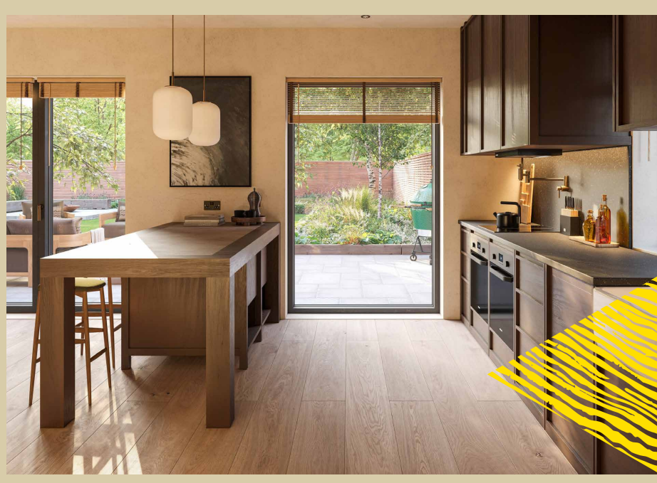
Computer generated image is indicative only

Band A: £1,462 Band B: £1,705 Band C: £1,949 Band D: £2,193 Band E: £2,680 Band F: £3,167 Band G: £3,655 Band H: £4,386