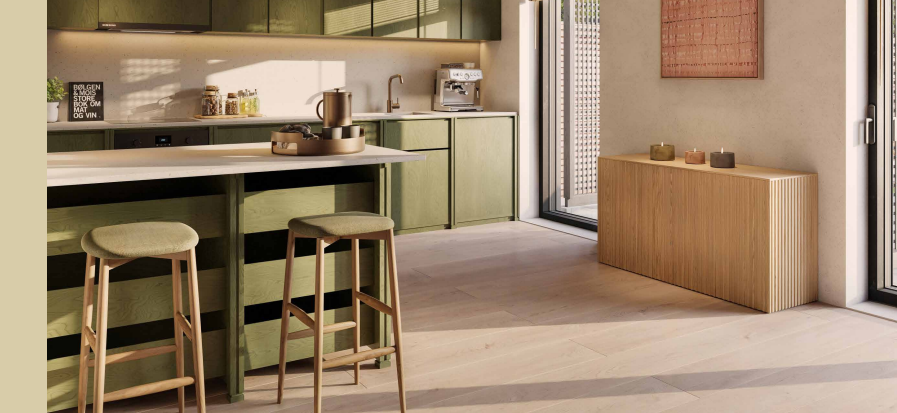
Computer generated images are indicative only