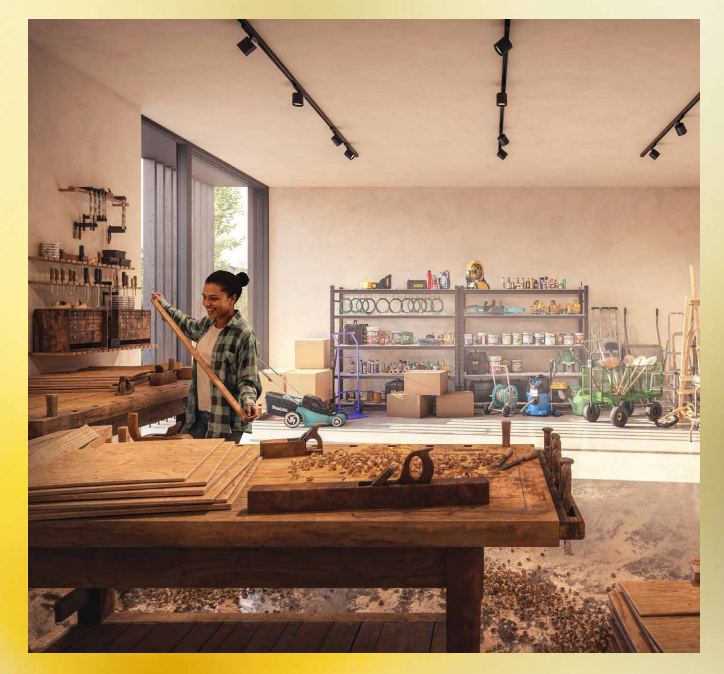
Computer generated images are indicative on