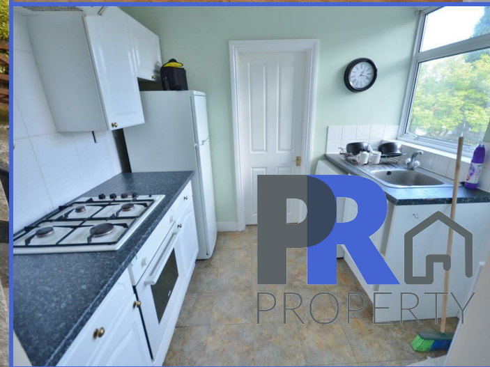
37 Preston Gardens, Luton, Bedfordshire, LU2 7NL £1,250 PCM