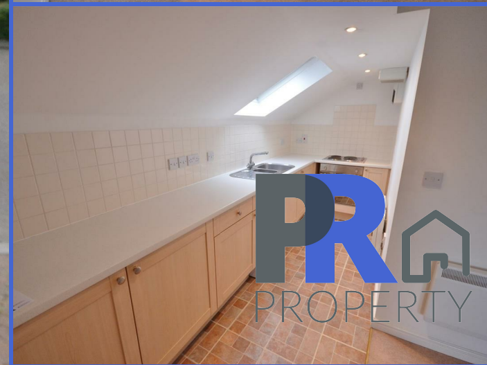
Flat 9, 121 Gardenia Avenue, Luton, Bedfordshire, LU3 2NE £950 PCM