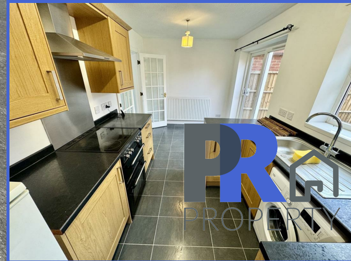
41 Mill Lane, Barton-Le-Clay, Bedfordshire, MK45 4LN £1,550 PCM