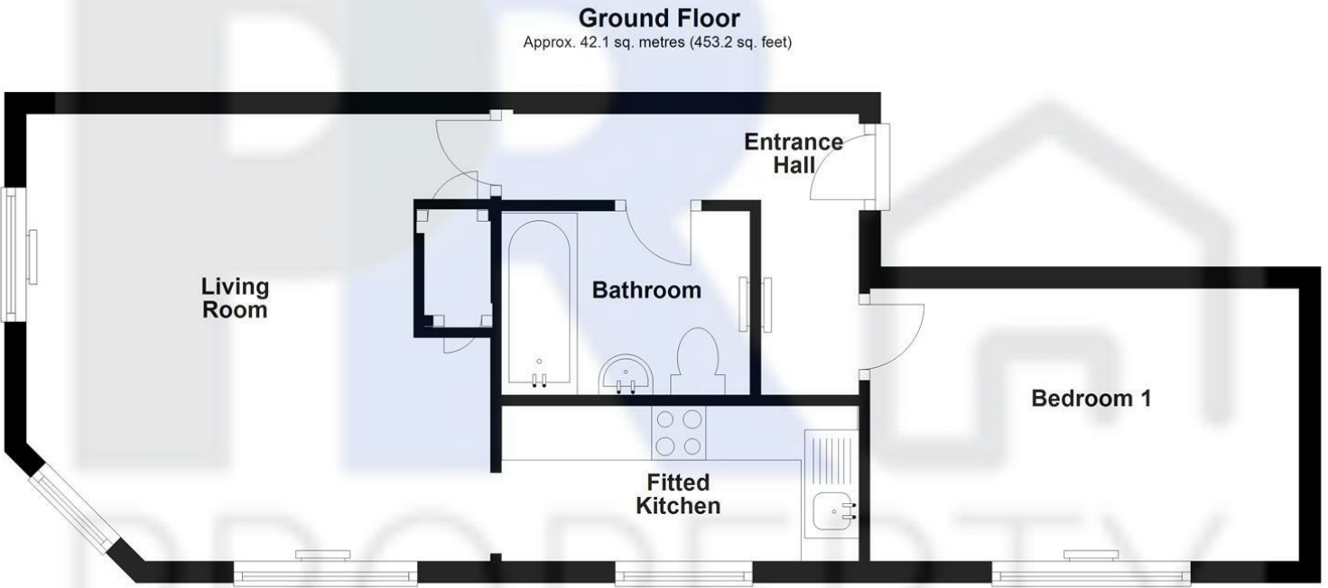
Ground Floor Approx. 42.1 sq. metres (453.2 sq. feet)

Total area: approx. 42.1 sq. metres (453.2 sq. feet) 8 hibbert street