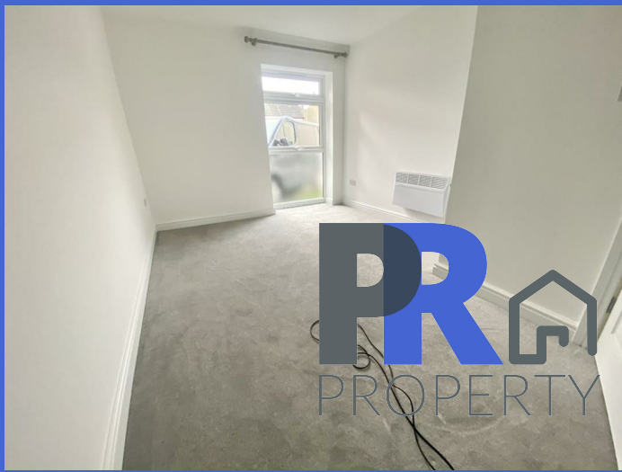
1 Gainsborough Court Stockingstone Road, Luton, Bedfordshire, LU2 7NQ £165,000