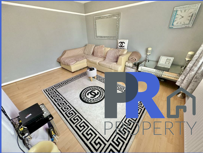
8 Dewsbury Road, Luton, LU3 2HH Offers in the region of £150,000