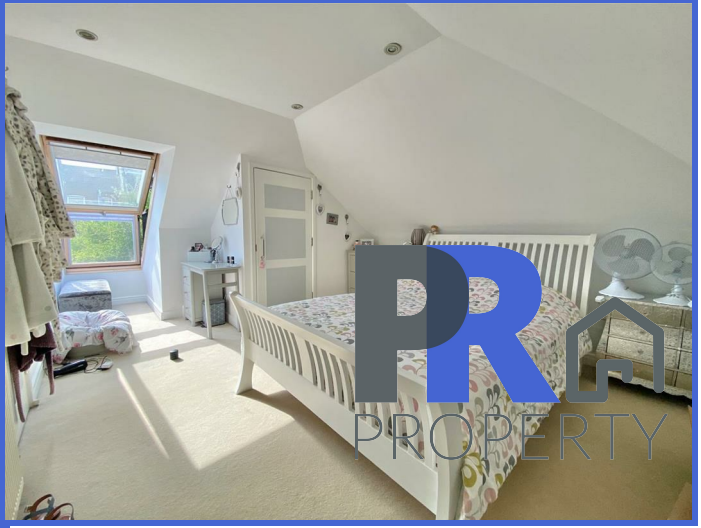
1 Hogarth Close, 438 Hitchin Road, Luton, Bedfordshire, LU2 7ST £2,000