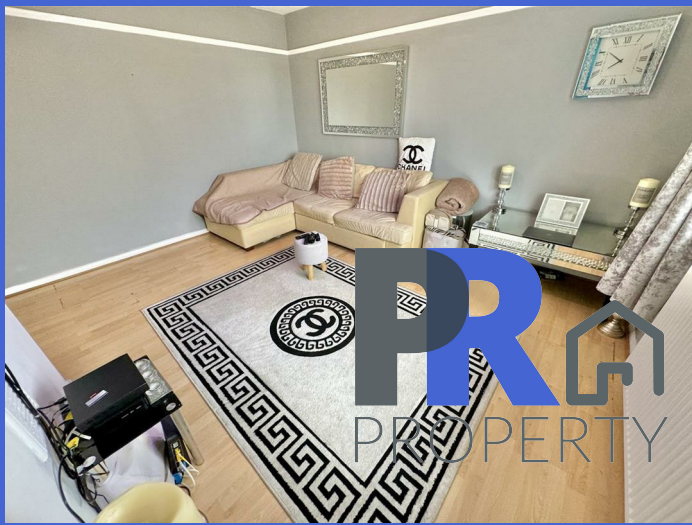
8 Dewsbury Road, Luton, LU3 2HH Offers in the region of £155,000