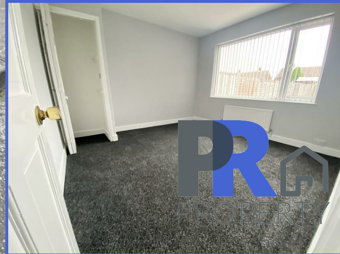
7 Canberra Gardens, Luton, Bedfordshire, LU3 2EU £1,350 PCM