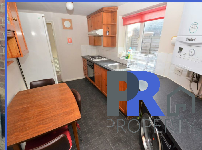
25 Hibbert Street, Luton, Bedfordshire, LU1 3UU £1,300