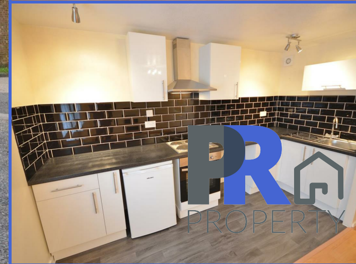
22 Burfield Court, Handcross Road, Luton, Bedfordshire, LU2 8JY £825 PCM