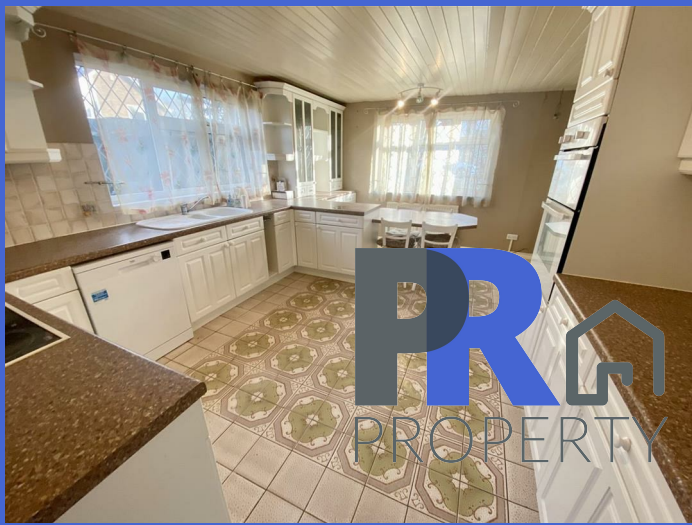
56 Washbrook Close, Barton-Le-Clay, Bedfordshire, MK45 4LF £1,700