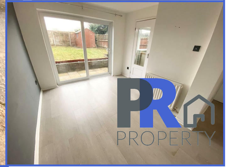
179 Buckingham Drive, Luton, Bedfordshire, LU2 9RE £1,600 PCM