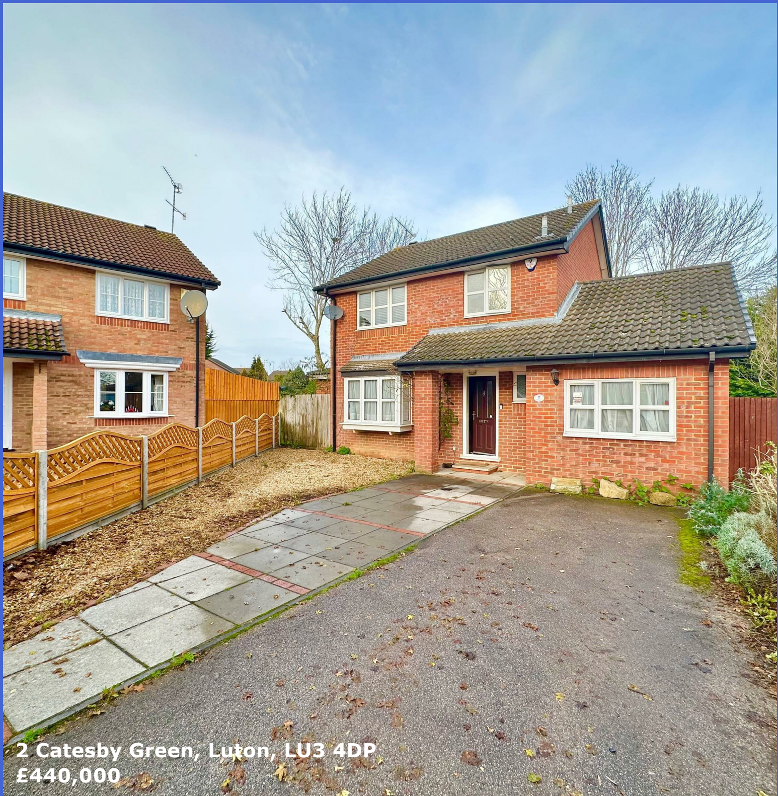
2 Catesby Green, Luton, LU3 4DP £440,000