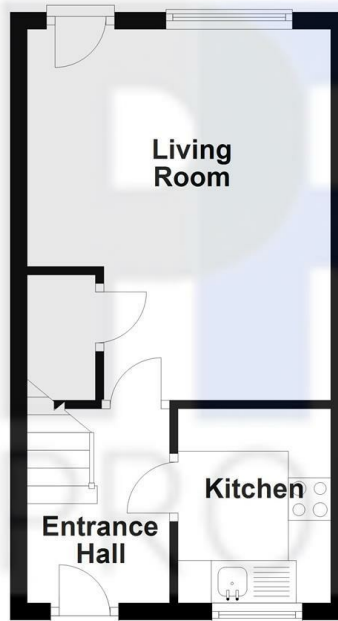
Ground Floor Approx. 24.6 sq. metres (264.5 sq. feet)