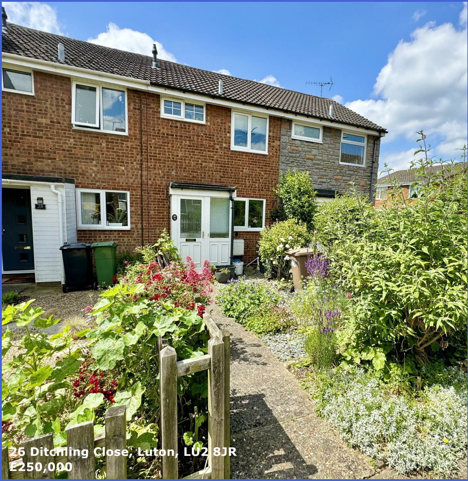
26 Ditchling Close, Luton, LU2 8JR £250,000