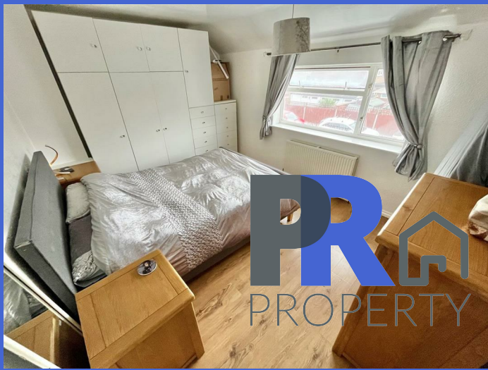
30 Briar Close, Luton, Bedfordshire, LU2 8EA £1,300