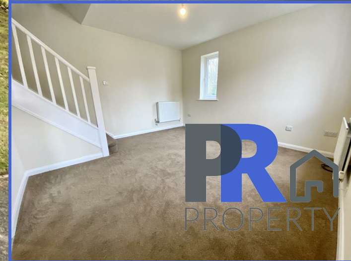
34 Cromer Way, Luton, Bedfordshire, LU2 7EE £975