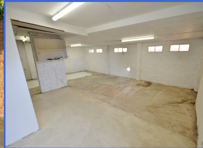
Rear of, 27 Wigmore Lane, Luton, Bedfordshire, LU2 8AA £500 PCM