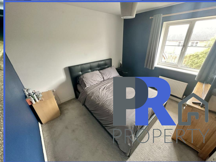
8 Fossett Grove, Dunstable, LU6 3FJ £290,000