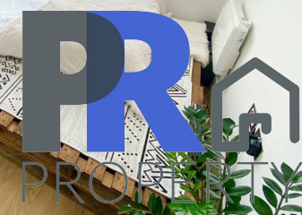
76, Arrowhead House Laporte Way, Luton, LU4 8FF £950 PCM