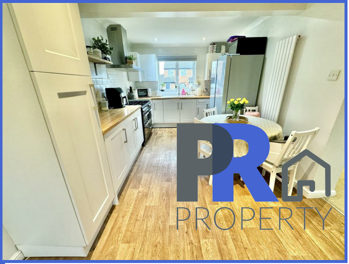
31 Trent Avenue, Flitwick, Bedfordshire, MK45 1SH £365,000