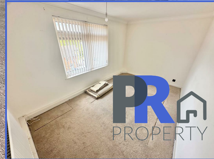
33 Denham Close, Luton, LU3 3TS Asking price £160,000