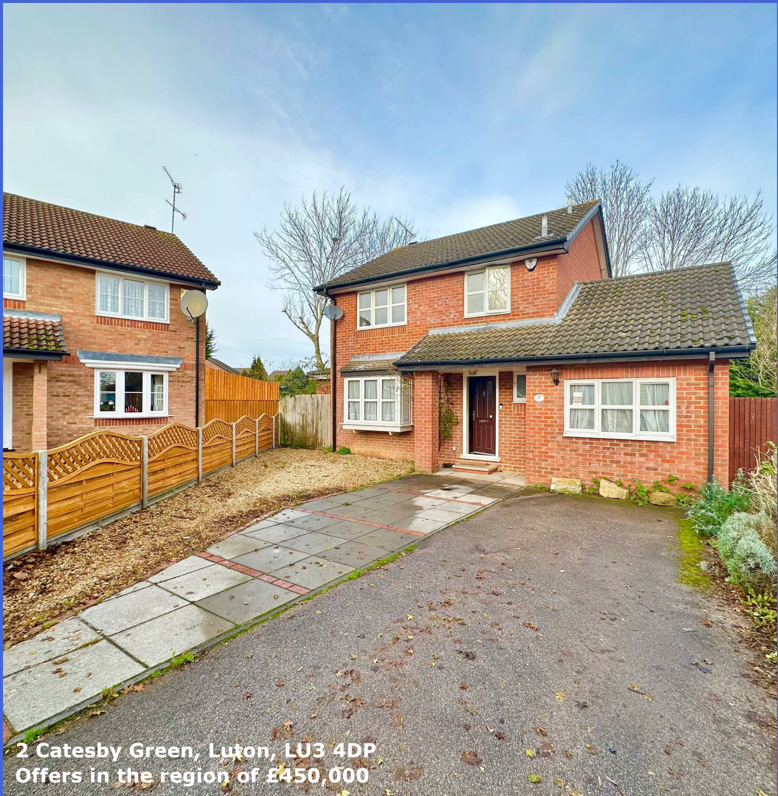
2 Catesby Green, Luton, LU3 4DP Offers in the region of £450,000