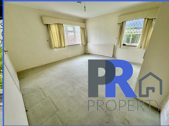
56 Washbrook Close, Barton-Le-Clay, Bedfordshire, MK45 4LF £550,000