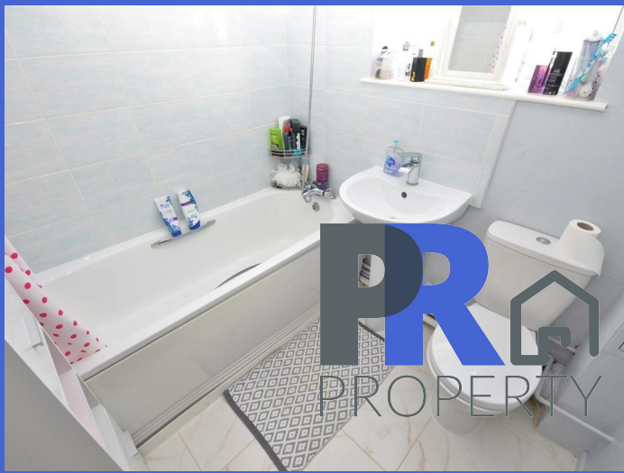
15 Denham Close, Luton, Bedfordshire, LU3 3TS £165,000