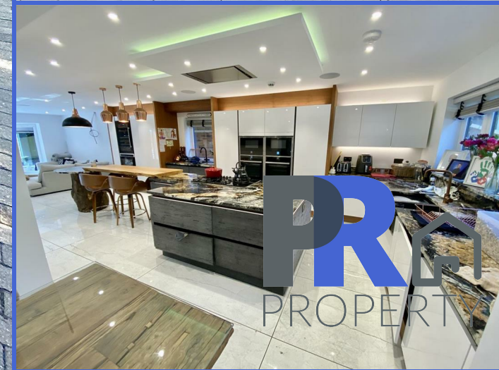
Edward Dillon House, 4 Wild Cherry Drive, Luton, LU1 3UH Offers in the region of £1,200,000