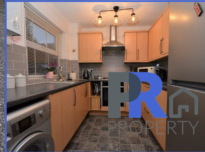
23 Kershaw Close, Luton, Bedfordshire, LU3 4AT Offers in the region of £365,000