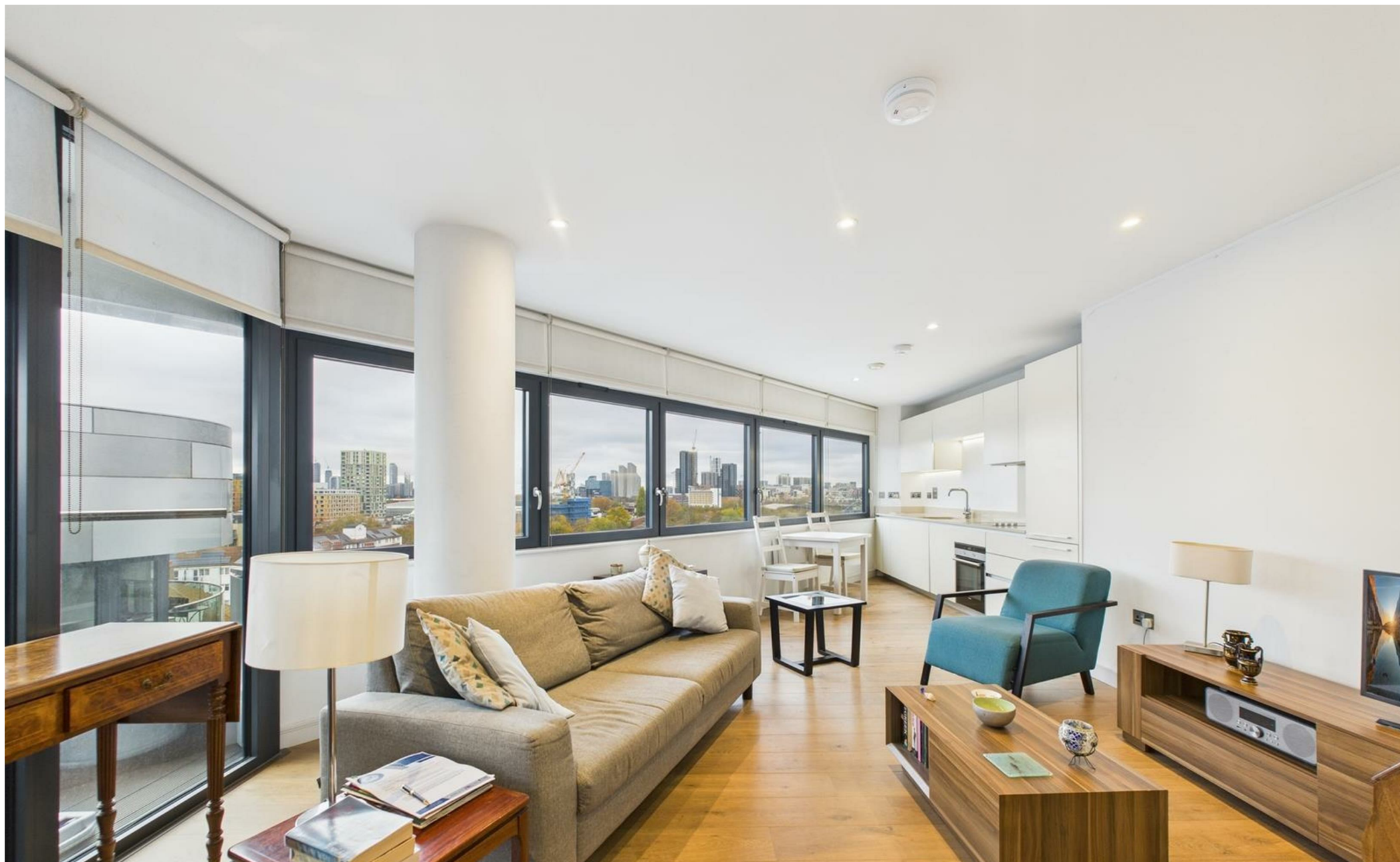
31 8 Lambarde Square, Greenwich, London, SE10 9GB £395,000