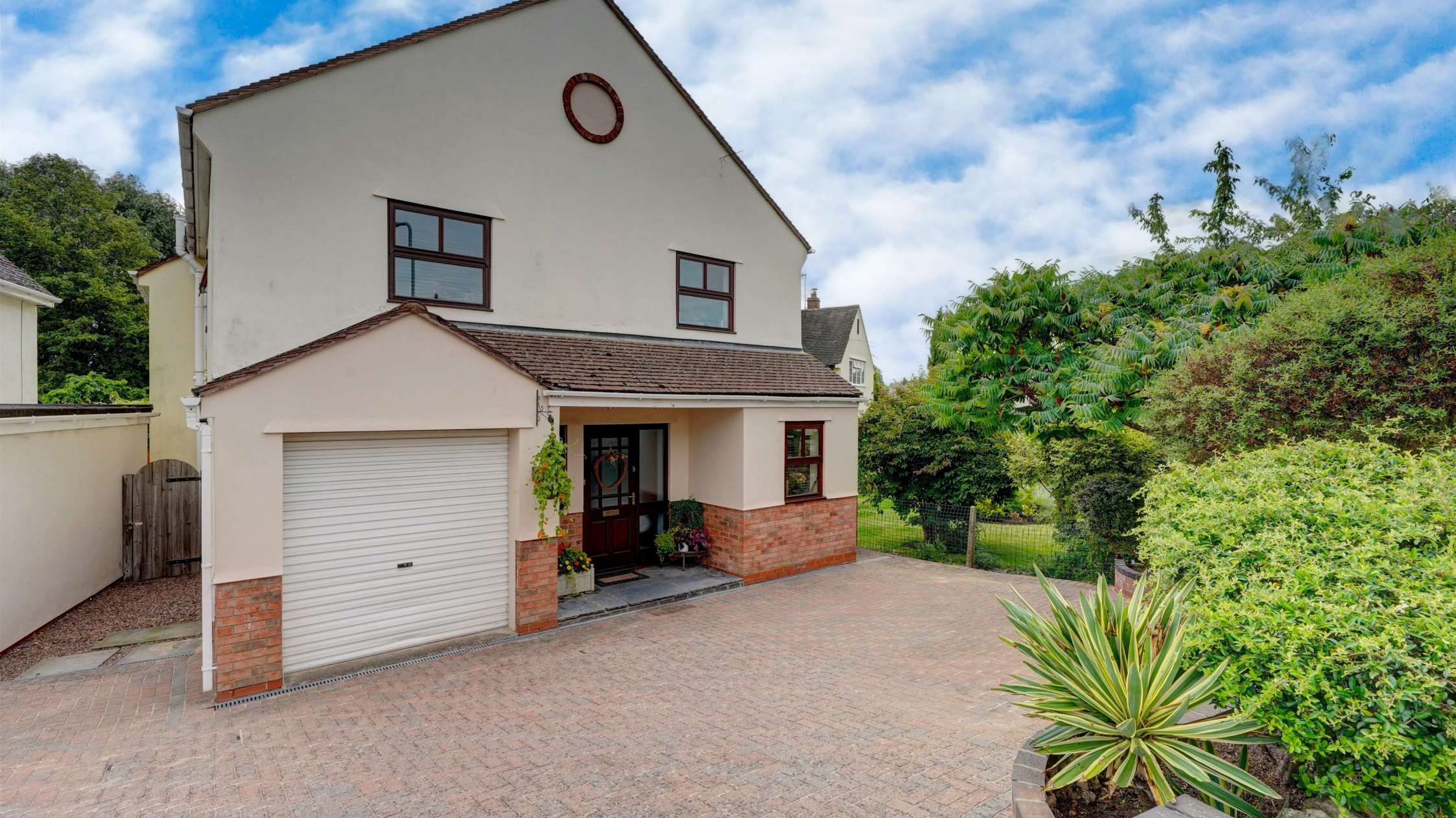
"Bluemoon", Cherry Orchard Pershore | Worcestershire | WR10 1EL