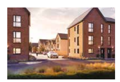
Saxon Reach, Milton Keynes Ighomes.com/saxonreach