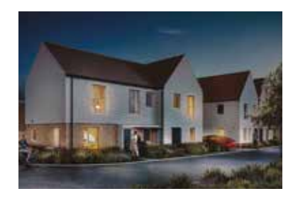
The Arbour, Chelmsford Ighomes.com/beaulieuarbour