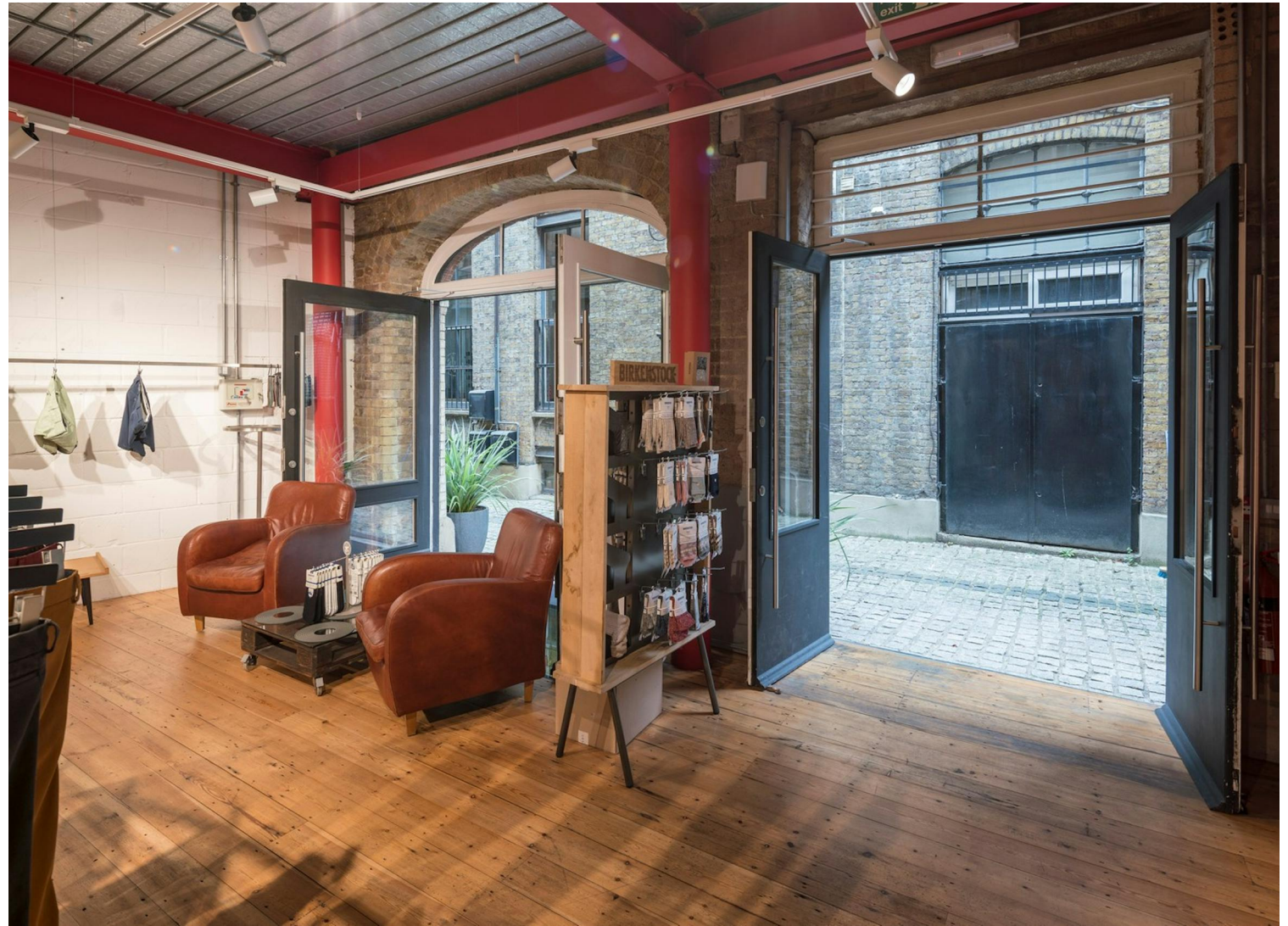
Entrance / Reception