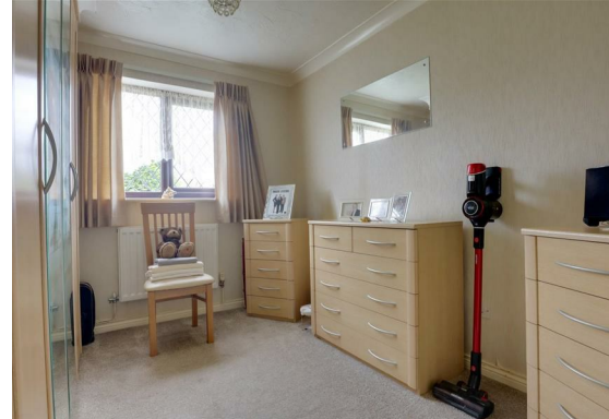
Main Bedroom 10'11" x 8'11" (3.33m x 2.72m)