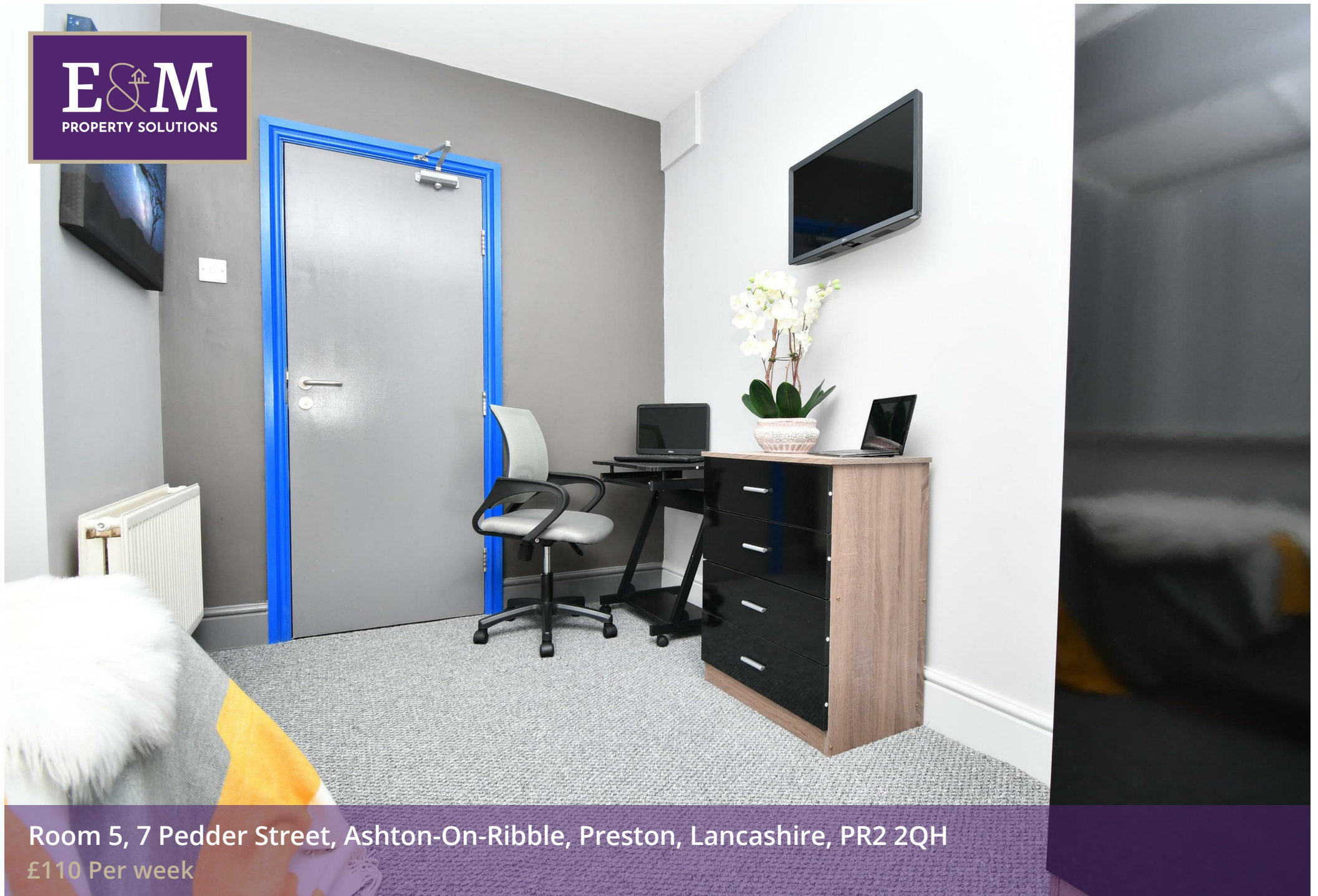
Room 5, 7 Pedder Street, Ashton-On-Ribble, Preston, Lancashire, PR2 2QH £110 Per week