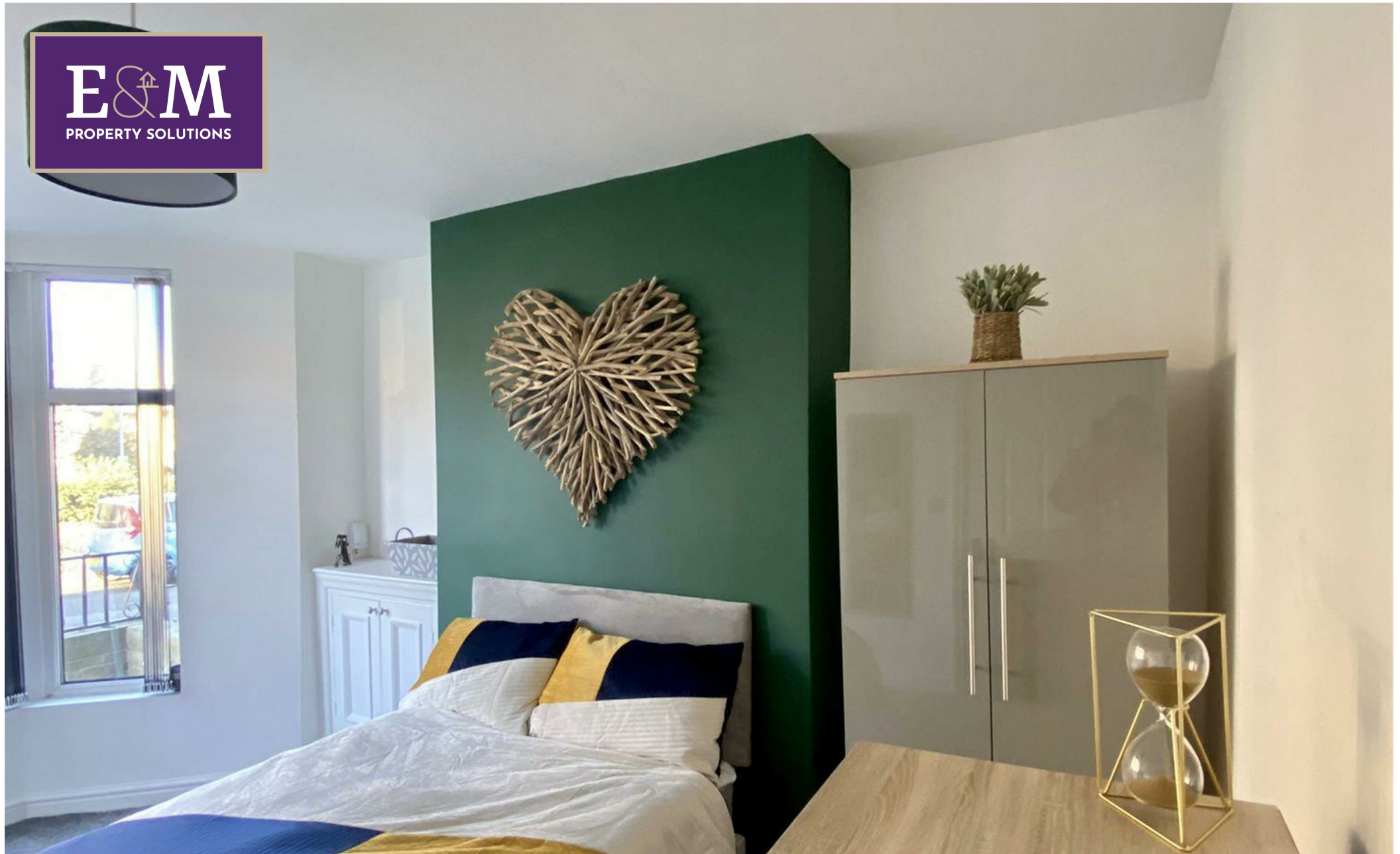
Room 1, 52 Albion Street, Burnley, Lancashire, BB11 4JG £95 Per week