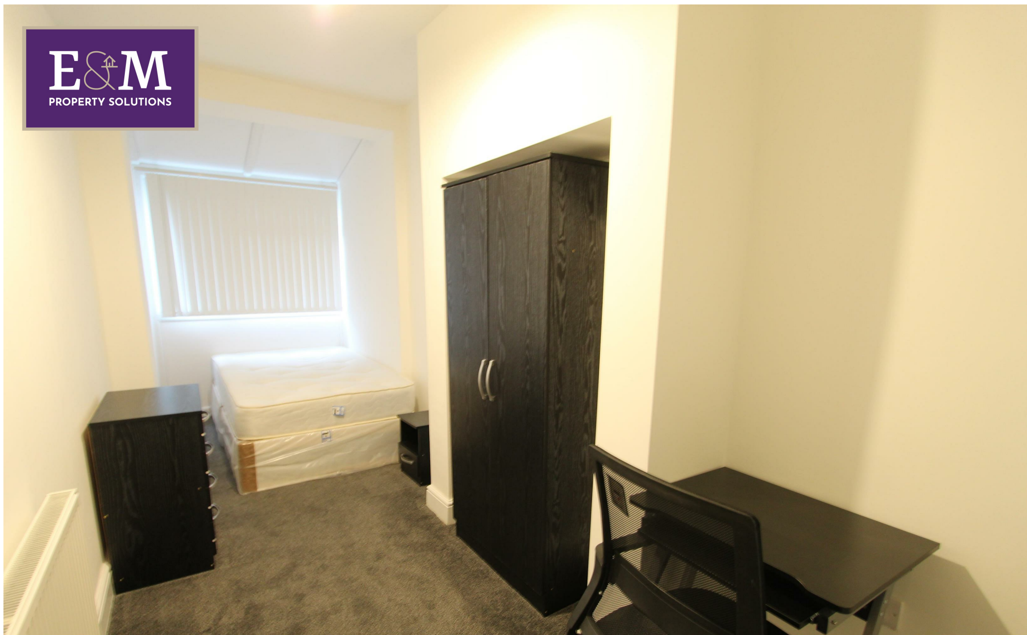
ROOM 2, 82 Every Street, Burnley, Lancashire, BB11 4LP £95 Per week