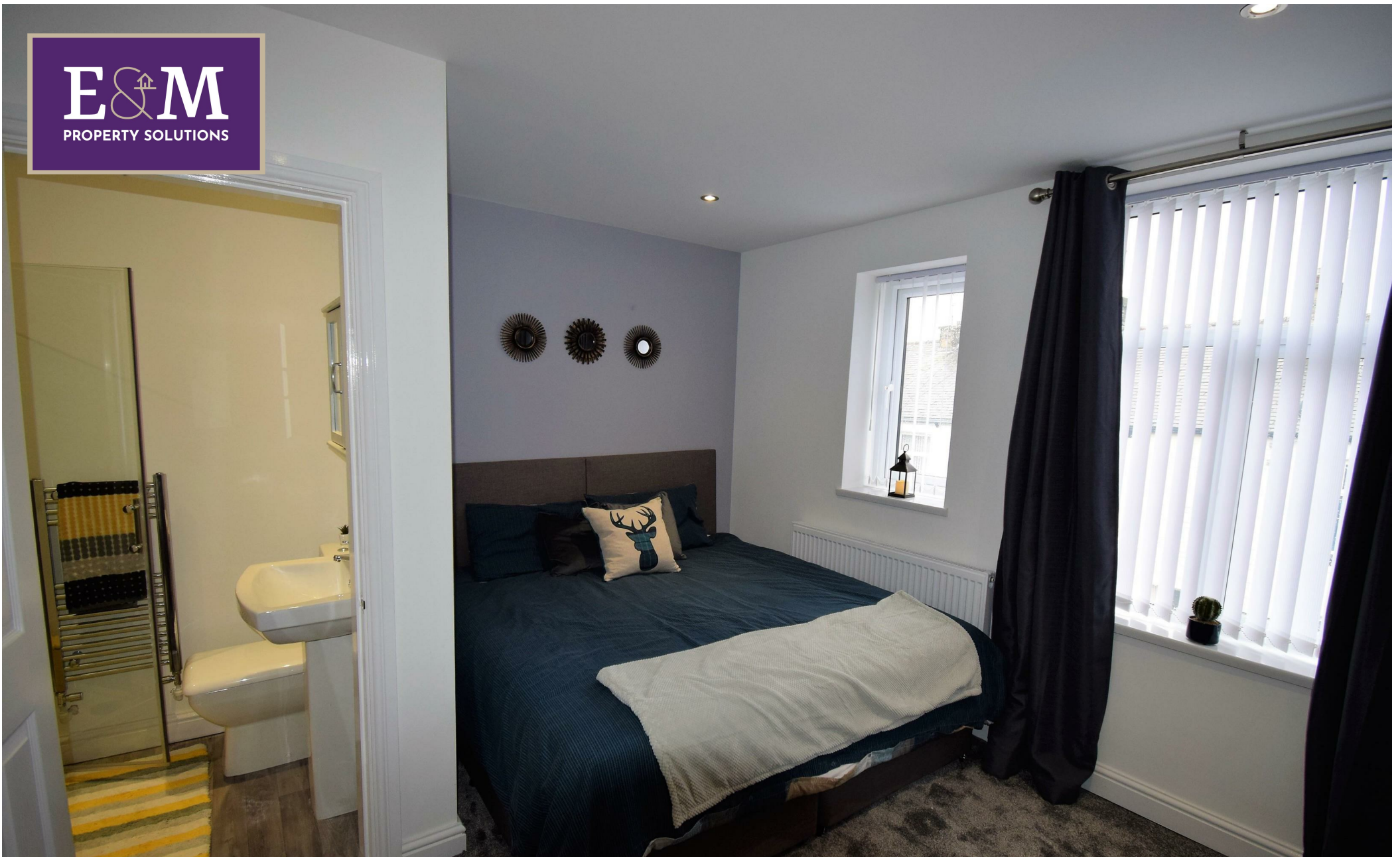
ROOM 2, 11 Lubbock Street, Burnley, Lancashire, BB12 6QY £520 Per month